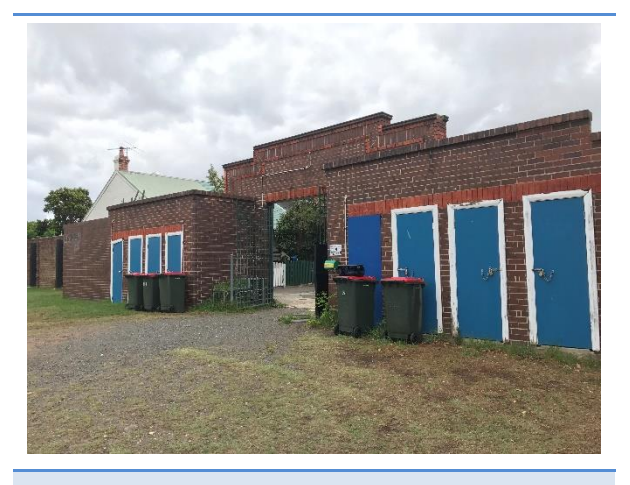
Photo No access to interior of the building at the time of assessment. No hazardous building materials suspected at the time of assessment.